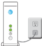
AT&T Smart Wi-Fi Extender